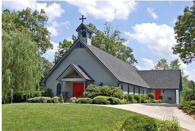
St. Luke's Church, "The Parish Church of the Mountains," 7 Ewing St., (POB 1821), Blue Ridge, Georgia 30513; (706) 632-8245; www.stlukesblueridge.org ; stlukes@tds.net .