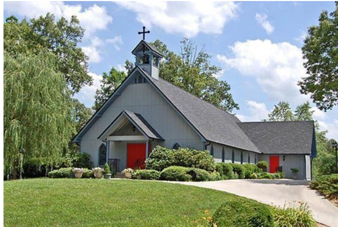
St. Luke's Church, "The Parish Church of the Mountains," 7 Ewing St., (POB 1821), Blue Ridge, Georgia 30513; (706) 632-8245; www.stlukesblueridge.org ; stlukes@tds.net .