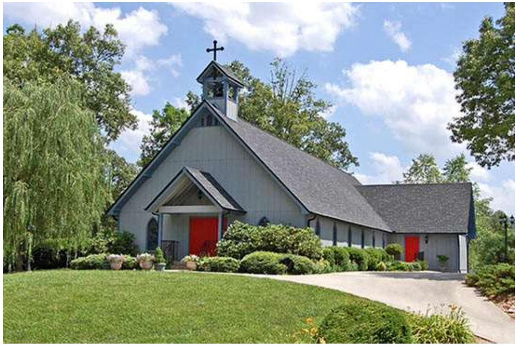
The Parish Church of the Mountains

The Mission of St. Luke's Church is to grow spiritually in the knowledge and love of Jesus Christ and in the fellowship of the Holy Spirit and to share our faith, our hands and our hearts for the sake of the Gospel, our community and the world