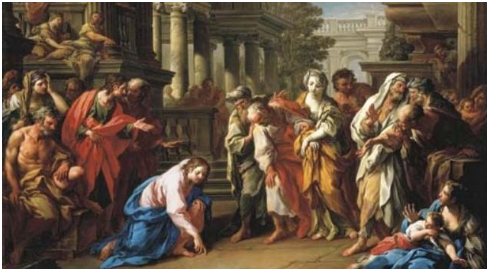
Christ and the Woman taken in Adultery' by Sebastiano Conca

LIVING OUT OUR FAITH continues to be the focus of the Trinity season.