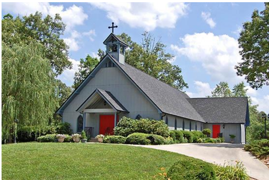
The Parish Church of the Mountains